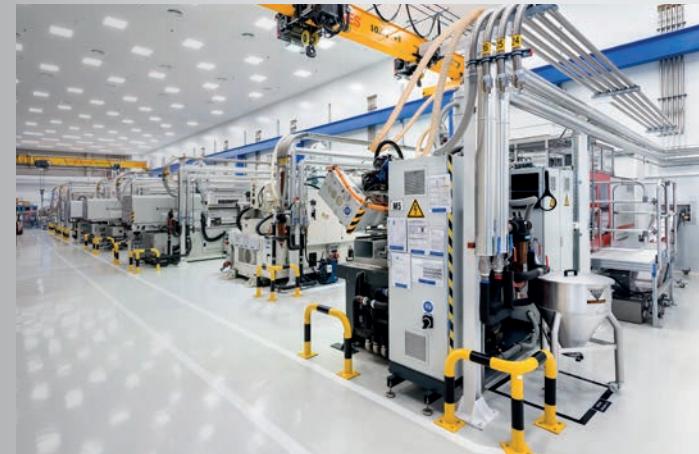
Automation for Diagnostics