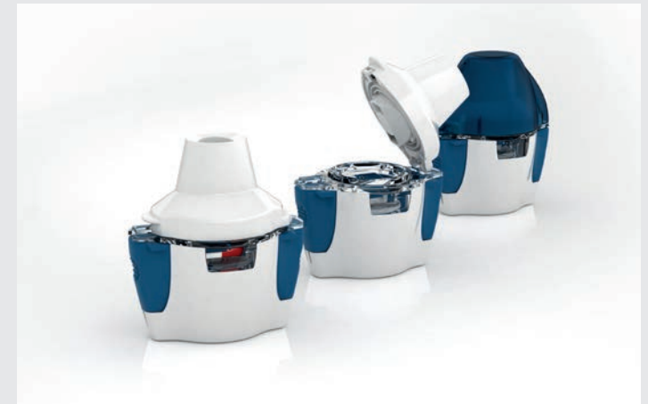
Sunriser High Performance DPI Technology