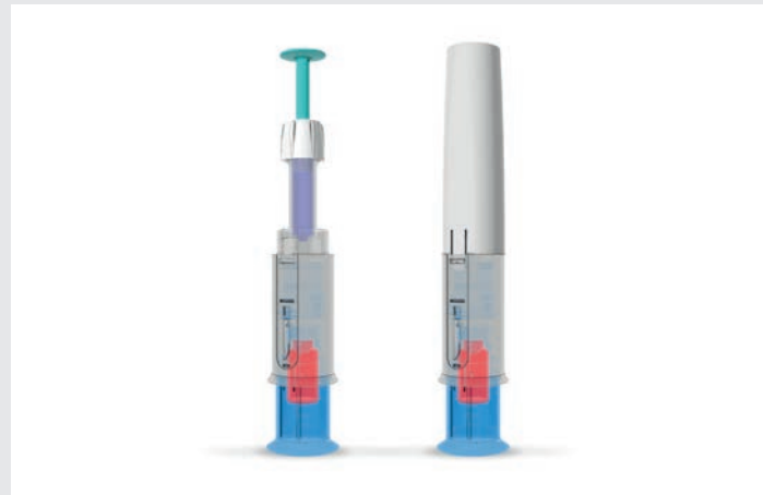
Reconstitution Device Development