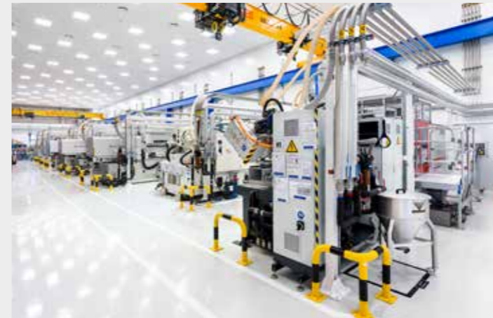
Automation for Diagnostics