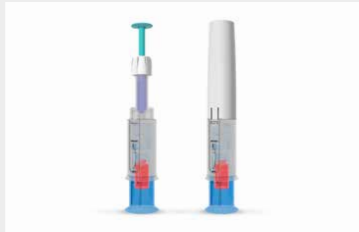
Reconstitution Device Development