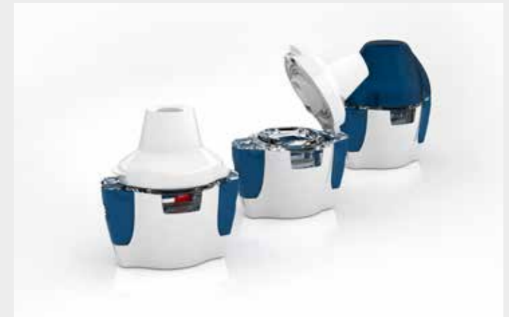
Sunriser High Performance DPI Technology